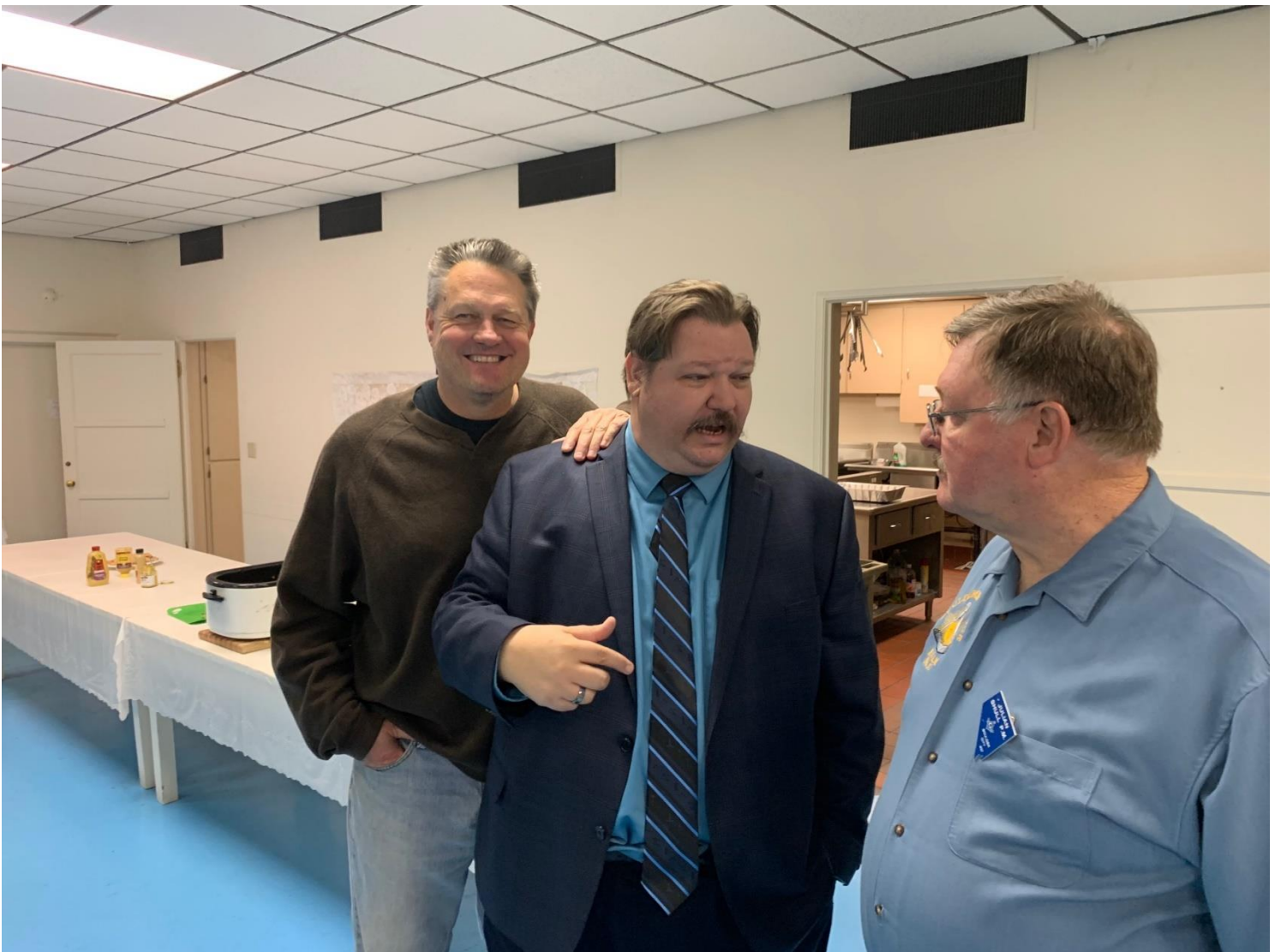
Stated Meeting Dinner